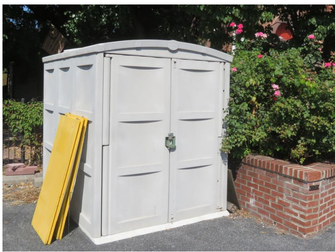
The session voted to remove the old snowblower shed from the parking lot.